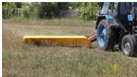
TRIVERS 280M Mounted rotary mower Required power 80 h.p. Operating speed 12 km/h Operating width 2,8 m Swath width до 2,5 m