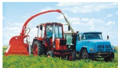
CH15 Mounted rotary mower-shredder Required power 55 h.p. Operating speed 8 km/h Operating width 1,5 m Discharge height 3,6 m