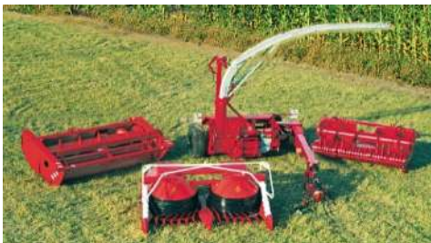
AKVILON 300T Pull-type forage harvester With tractors 110-185 h.p. Maize header 3,0 m Pick-up 1,85 m Grass header 3,4 m