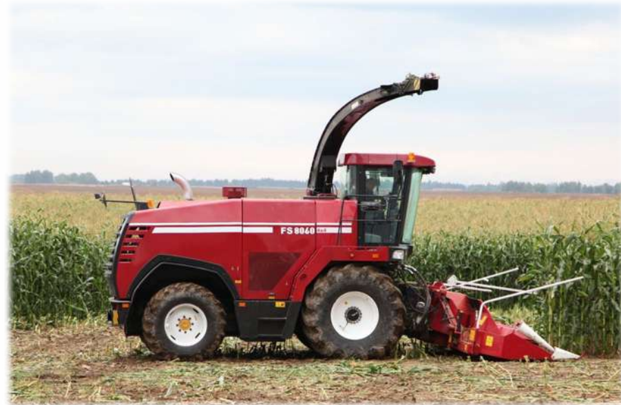
2021 – high-producing forage harvester FS8060