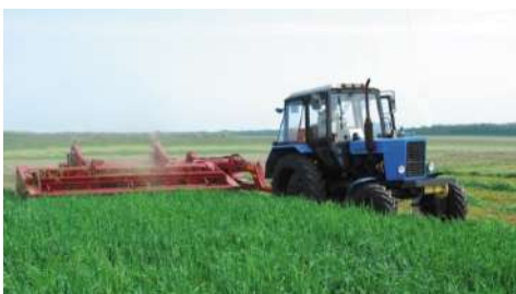
CT42 Pull-type mower-conditioner Required power 80 h.p. Operating speed 7 km/h Operating width 4,2 m Swath width 0,8-1,6 m