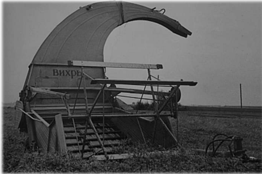
1930 – disk silage chopper

GOMSELMASH history dates back to 1930. From the production of simple agricultural machines to the development and mass production of high-performance grain and forage harvesters, machine complexes based on universal power vehicle and other agricultural equipment.