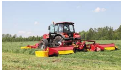
TRIVERS 870M Rotary mounting mower-crusher Required power 218 h.p. Operating width 8,7 m Quantity of disks 8 pcs Swath width 1,8 m