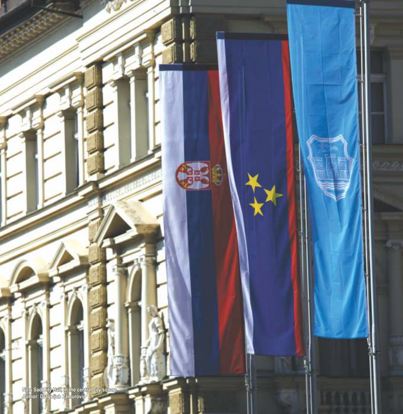
Novi Sad City Hall, in the central city square Author: DragoJub Zamurović