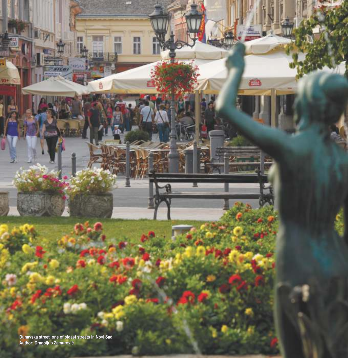
Dunavska street, one of oldest streets in Novi Sad Author: Dragoljub Zamurović