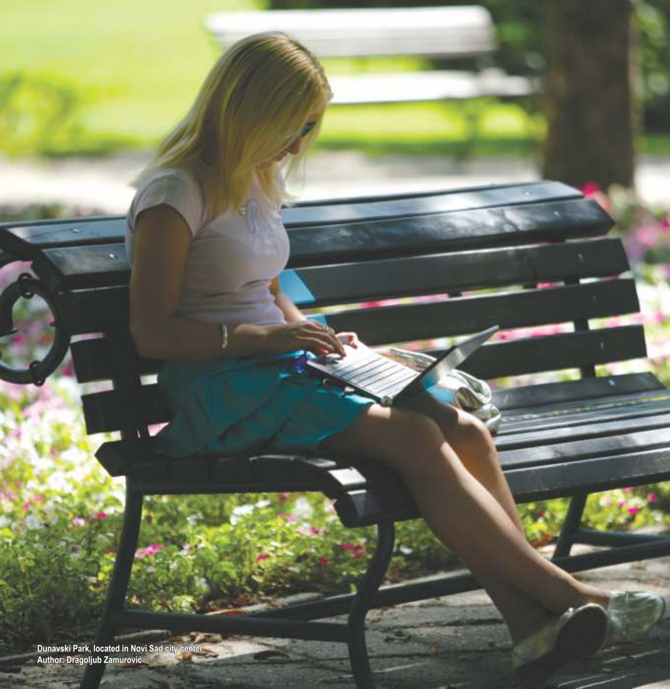
Dunavski Park, located in Novi Sad city center Author: Dragoljub Zamurović